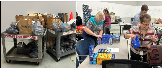
Above: Pioneers organize food items and pack those boxes!

A lot of planning and time goes into this project each year. After volunteers collect and organize food items, they begin boxing them up.