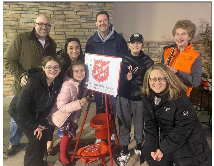
The Monday family serving at the red kettle location, along with some of their close friends.