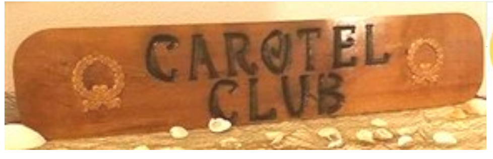
Carotel Club / Tar Heel Chapter June 2024 Newsletter Issue 10